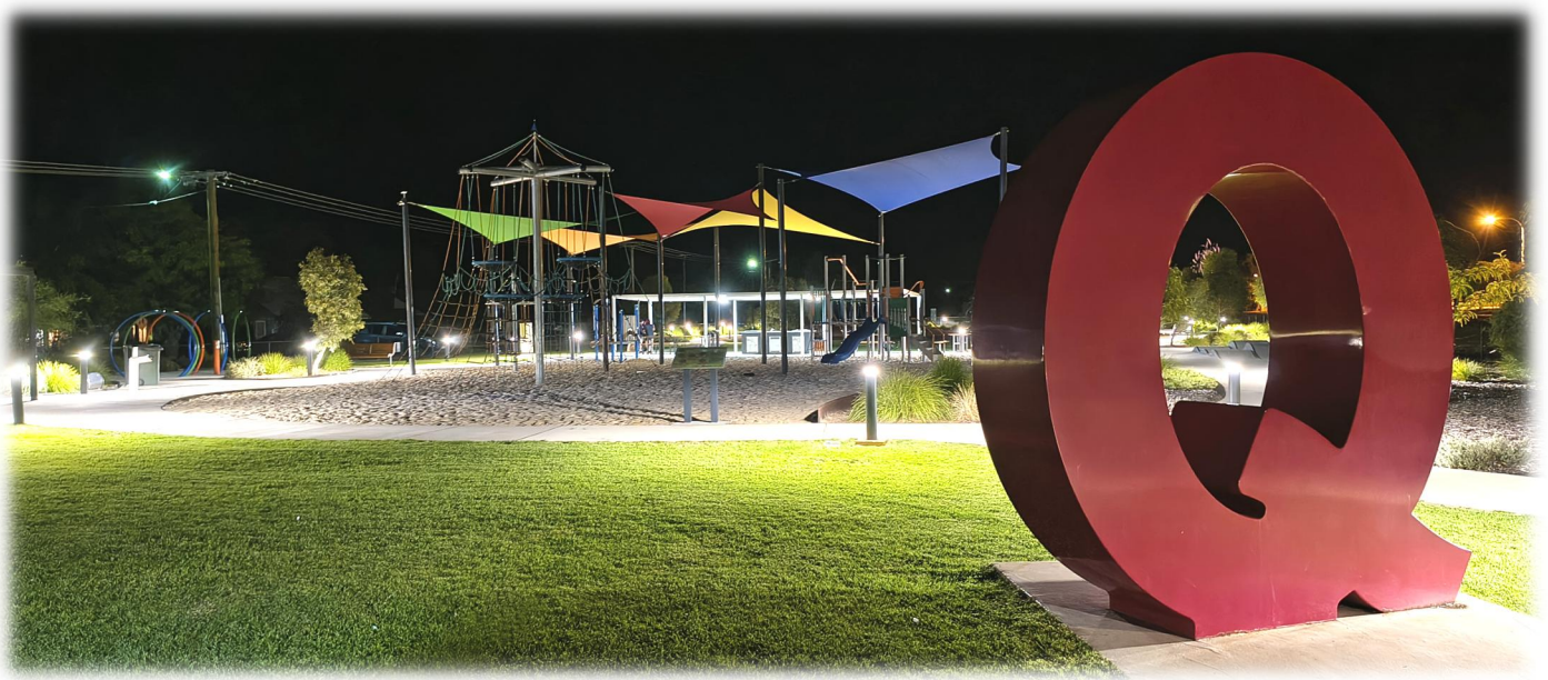
Quairading Play Ground at Night.