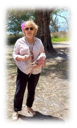
3<sup>rd</sup> Race Elma