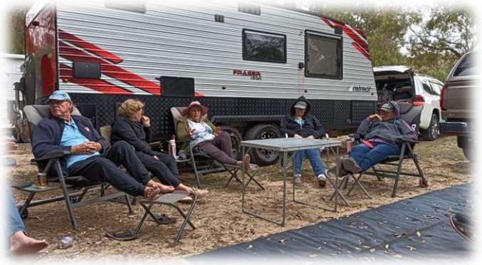
Page 3 of 8