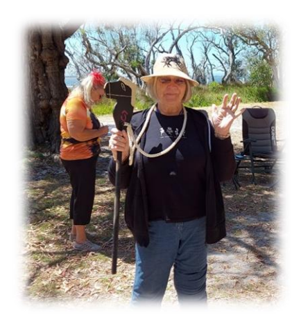
1<sup>st</sup> Race Corrie