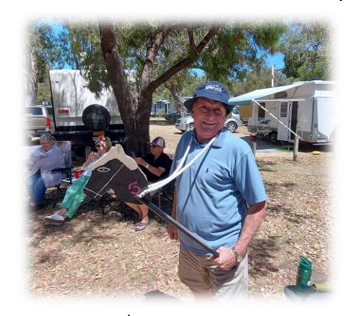
2<sup>nd</sup> Race Len Second round of races won by: